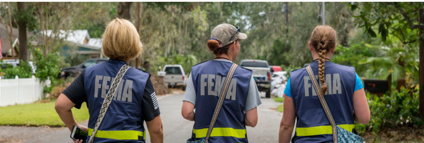
FEMA Disaster Survivor Assistance (DSA) team members canvass neighborhoods to ensure that residents are aware of FEMA assistance for damage from Hurricane Irma.

“Responding to and recovering from any disaster is a whole community effort that relies on the strength of Federal, state, local, tribal, and territorial governments, as well as non-governmental entities and individuals, in addition to FEMA.”