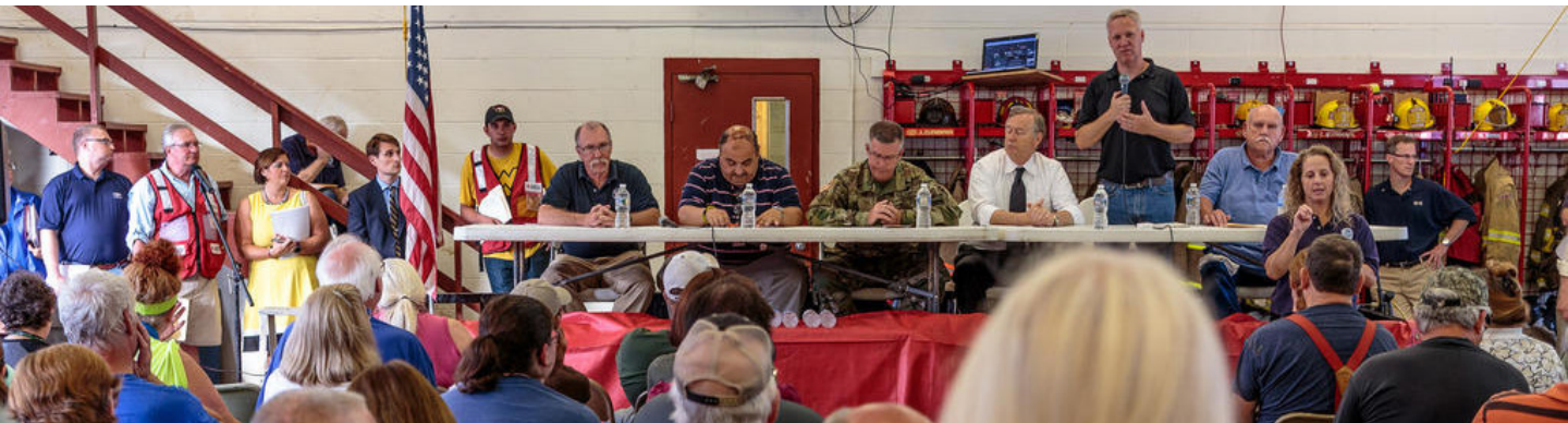
Flood survivors attend a community town hall meeting to ask questions about aid programs and recovery plans.

The most effective form of emergency management is one in which every member of the community understands his or her important and indispensable role. Likewise, the most effective strategies for emergency management are those that are Federally supported, state managed, and locally executed. FEMA's role is to coordinate Federal Government resources to supplement SLTT capabilities. FEMA does this by coordinating through the hierarchical layers of government, meaning that states, tribes, and territories are our primary coordinating partners. It is through these sovereign layers that requests for assistance are made and through which FEMA coordinates the delivery of Federal assistance.