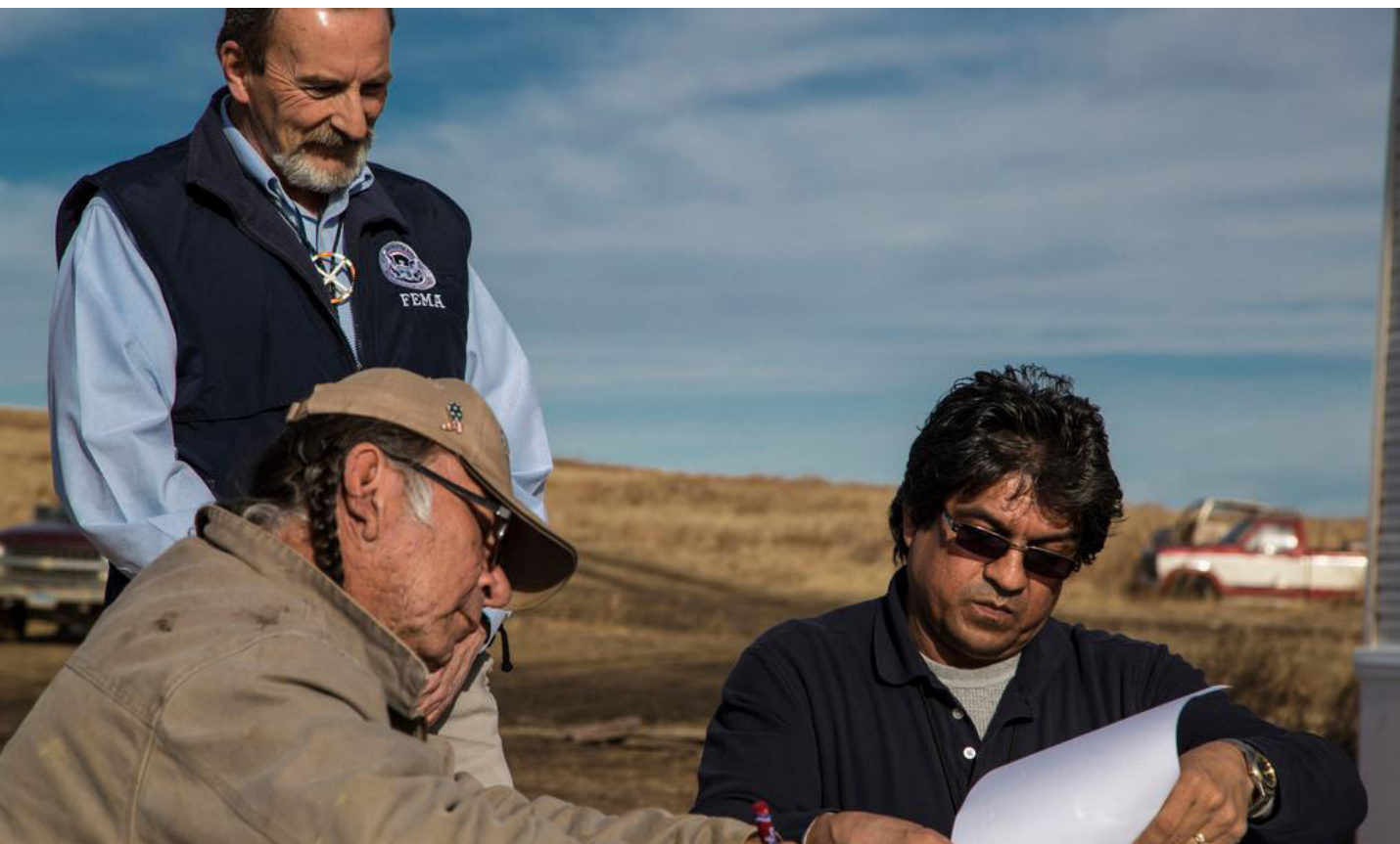
FEMA staff check final paperwork and title documents prior to the turnover of a FEMA Manufactured Housing Unit (MHU) for an Oglala Sioux Tribe member on the Pine Ridge Reservation.

As the emergency management environment shifts and changes, FEMA must remain flexible and adaptable with how it defines success. This includes soliciting and accepting stakeholder feedback on a regular basis. Consequently, each Strategic Objective describes what outcomes will be measured to assess progress. The Agency will consider potential challenges and risks to the Agency's strategy and success against the performance measures throughout the life of the 2018-2022 FEMA Strategic Plan. Ongoing refinement of FEMA's strategic direction over the next five years will ensure that FEMA is well positioned and adaptable to the future of emergency management and the risks we face as a Nation.