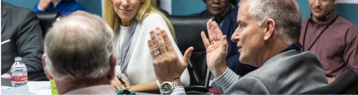
A FEMA staff member speaks at the Regional Interagency Coordination Recovery Meeting at the Joint Field Office (JFO) in Austin.