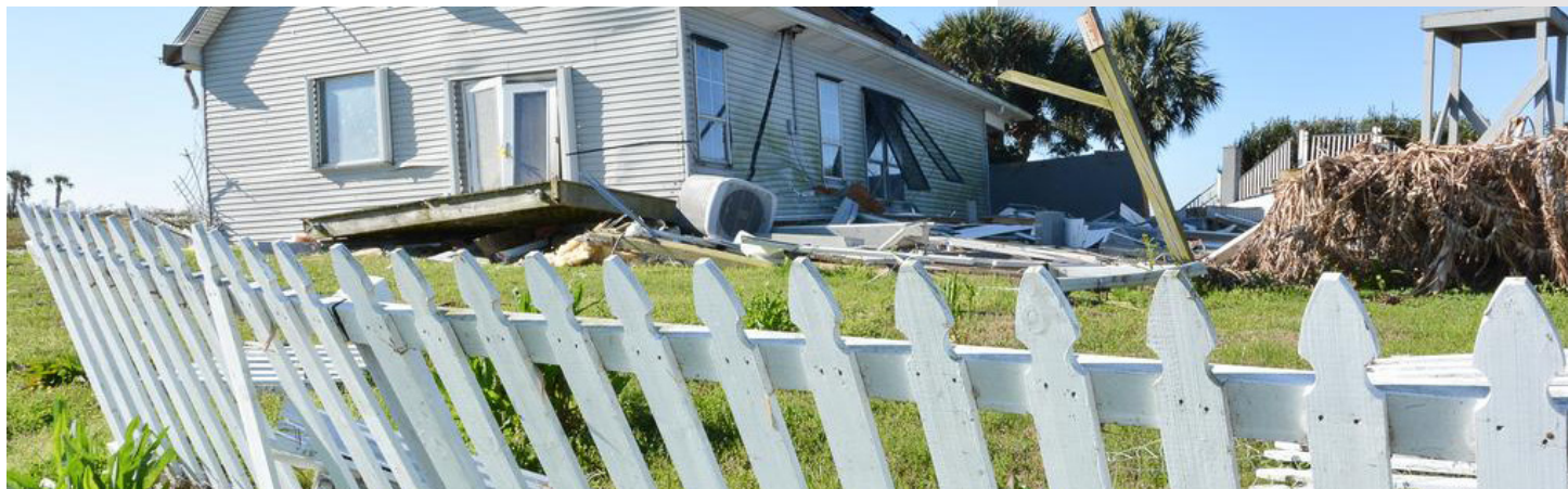
The effects of a tornado on a residential property in Madisonville, Louisiana. Property damage presents a significant challenge for survivors of catastrophic disasters.

Outreach presents an opportunity to learn from stakeholders with NDRF experience, better understand past challenges, and make improvements to how the NDRF is implemented moving forward.