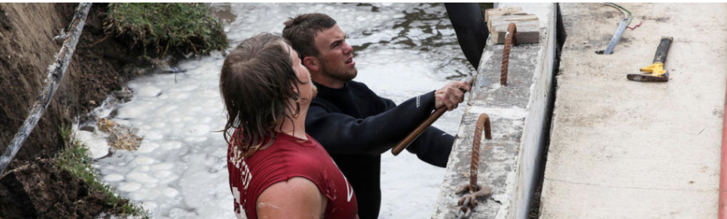
Hurricane Irma compromised about 12 miles of city owned seawalls in Punta Gorda, Florida. Two workers address the city's seawalls following the 2017 Hurricane Season.

Every $1 that the Federal Government invests in mitigation saves taxpayers an average of $6 in future spending.