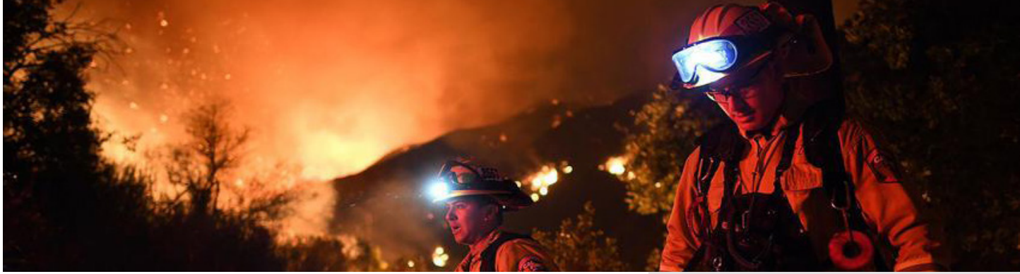
Two firefighters battle wildfires in California. FEMA played a significant role during California's 2017 wildfires.