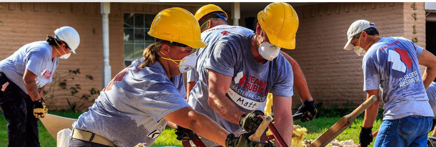
Team Rubicon works to help survivors in a neighborhood affected by Hurricane Harvey.

FEMA's role is to strategically stock the essential items needed to jumpstart a response, but effectively delivering resources in the face of a major disaster requires the continued development of robust partnerships and reliable