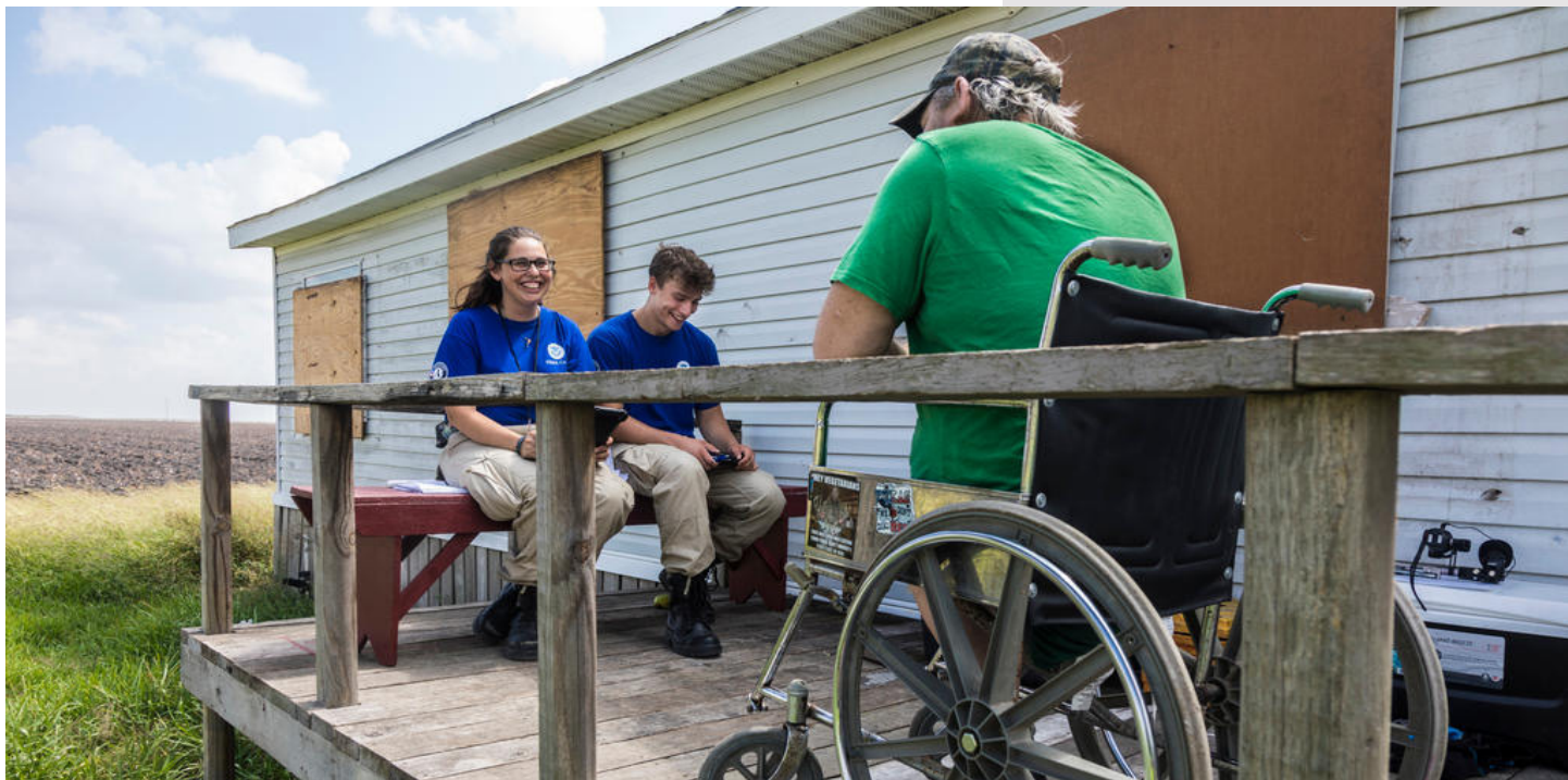
FEMA Corps Eagle 8 team members speak with a survivor in a rural part of Robstown, Texas after Hurricane Harvey.

Improving FEMA's analytics capabilities will enable the use of data-driven approaches to identify and address Agency-wide inefficiencies and risk.