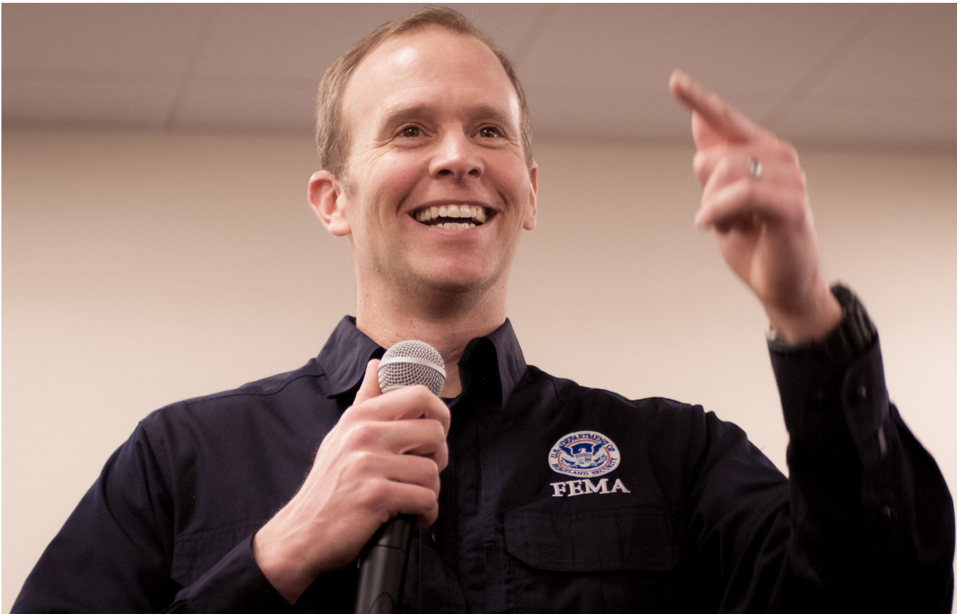
Administrator Long speaks at an Agency-wide Town Hall regarding the Strategic Plan and the future of FEMA.

FEMA represents the very best of the United States Government's public service – providing front-line support to the American people and assisting survivors in their times of greatest need. This Strategic Plan presents an outstanding opportunity for our Agency to improve by simplifying our processes, strengthening our workforce, and building new and stronger partnerships – working together to help people before, during, and after disasters to create a more prepared and resilient Nation.