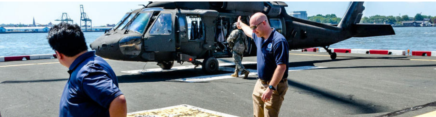
FEMA staff departing a military helicopter following an aerial assessment of Manhattan.