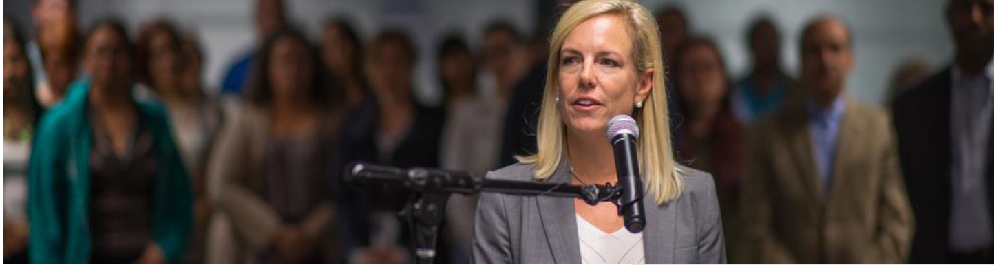
Kirstjen Nielsen, Secretary of Homeland Security, addresses staff in charge of response and recovery efforts at the new Joint Field Office (JFO) in Puerto Rico.