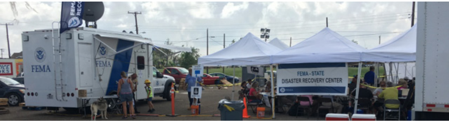
A FEMA-State Disaster Recovery Center is open for business in Texas.

Further, roles and responsibilities identified in the NDRF need to be clarified in practice. This includes maturing our understanding of the distinct roles of the Federal Disaster Recovery Coordinator, the Federal Coordinating Officer, and SLTT leadership, including Long-Term Recovery Managers. It is critical for leadership responsibilities and authorities to be clearly defined during active response and recovery operations and when multiple Federal agencies are involved. Clarity helps ensure integrated operations and coordination of Federal partner resources to support community recovery. It also enhances understanding of disaster complexities, community impacts, and opportunities for collaborative problem solving.