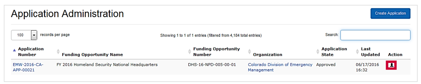
Figure 2. Click the Request Application Authorized Official Change icon to reassign the task

Click the Request Application Authorized Official Change icon in the Action column for the appropriate application.